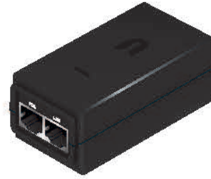
POE-15-12W POE-24-12W POE-24-12W-G