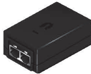
POE-24-24W POE-24-24W-G POE-24-30W