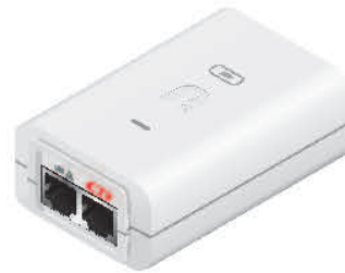
POE-24-24W-G-WH POE-48-24W-WH POE-48-24W-G-WH