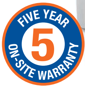
HL-6400DW Black & White Laser Printer