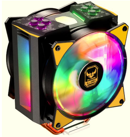
28 Addressable RGB LED- Fully Addressable RGB that is certified to sync with RGB Motherboard or controlled by MasterPlus+