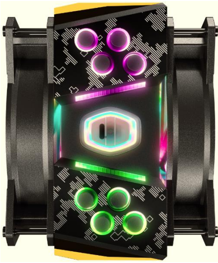
Hexagon Hologram Aluminum Fin- Specialized hologram cutout for unique color lighting and excellent heat dissipation